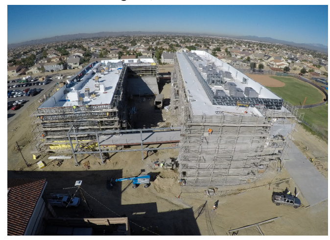
Buildings T1/T2 Exteriors