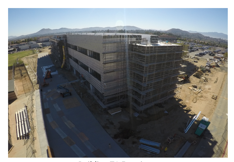
Building T1 Exterior