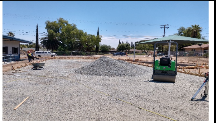
Play structure Base