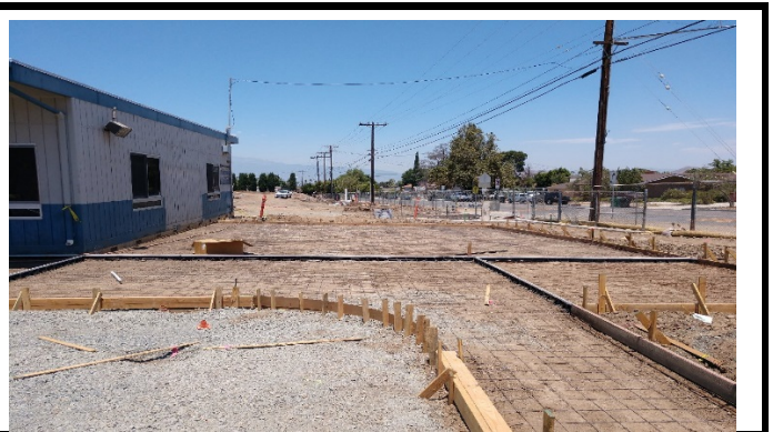
Concrete crew setting up Forms