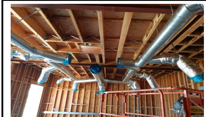
HVAC rough in Building D