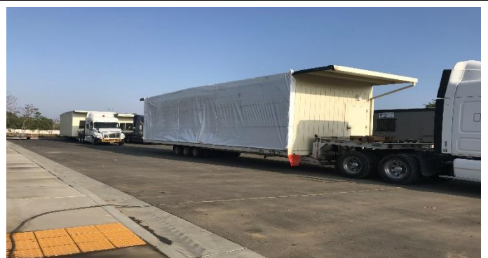
Removal of portables