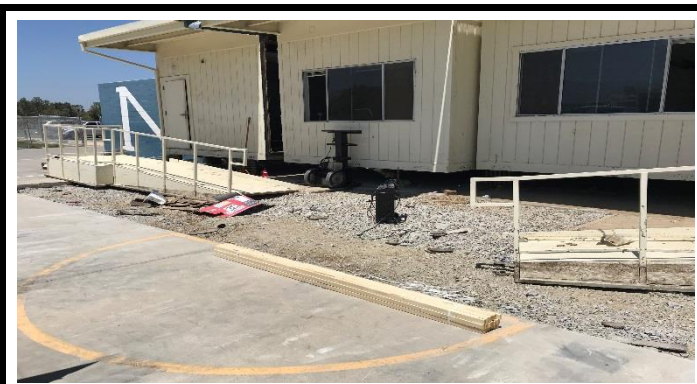
Demolition of concrete ramp