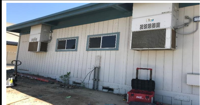
Removal of power